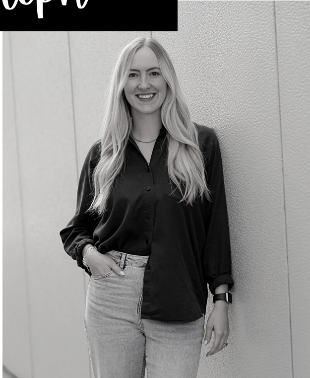
Owner & Director